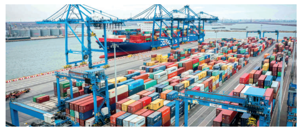
The Port of Constanta is located at the crossroads of the trade routes linking the markets of the landlocked countries from Central and Eastern Europe with the Caspian region, Central Asia and the Far East.

It the largest port in the Black Sea region and main Gate to the European Union. This status is assured also through its direct connection with the Danube River and its main riparian countries such as Hungary, Serbia, Austria, our traditional European customers and partners.