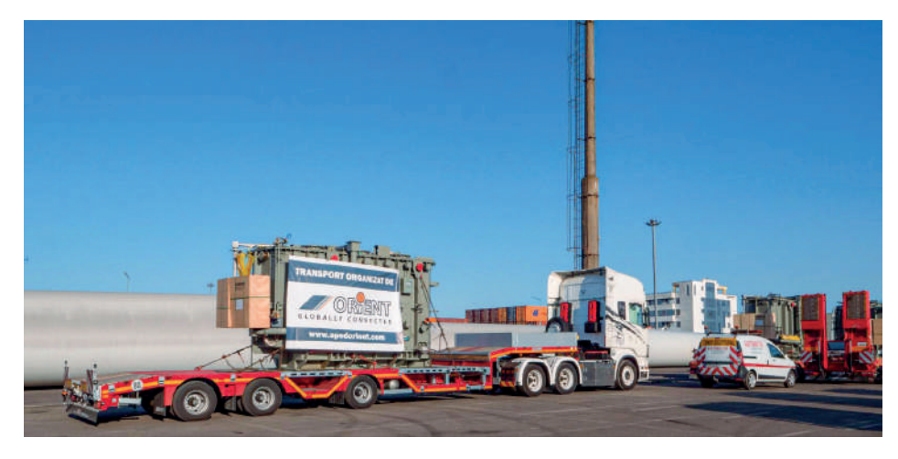
Founded in 1991 in Rădăuți, Suceava County, the company provides national and international transportation services.

Starting with five employees, it has expanded to Its experienced team ensures safe and timely a team of 109 professionals and has branches in Cluj, Arad, Iasi and Constanta, as well as storage centers in Rădăuti, Constanta, and Arad.